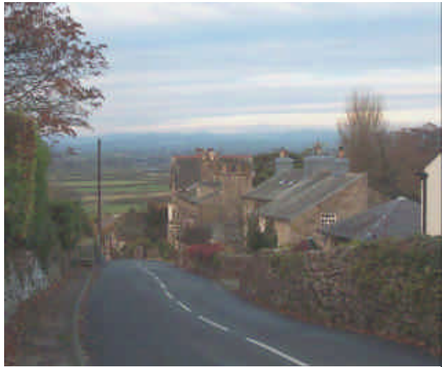
View from Yealand Conyers to Redmayne and beyond

Respondents to the survey were keen to preserve current open spaces in the villages so that they cannot be used for development. Again, recent legislation makes development less likely in the near future. There are specific areas which residents wish to be preserved. This particularly applies to the fields between the two villages and the fields bordered by Yealand Road, Roseacre Lane, Church Lane and Dykes Lane. However we must ensure that this does not mean a ‘green light’ for development elsewhere and must consult with Planning Officers on this