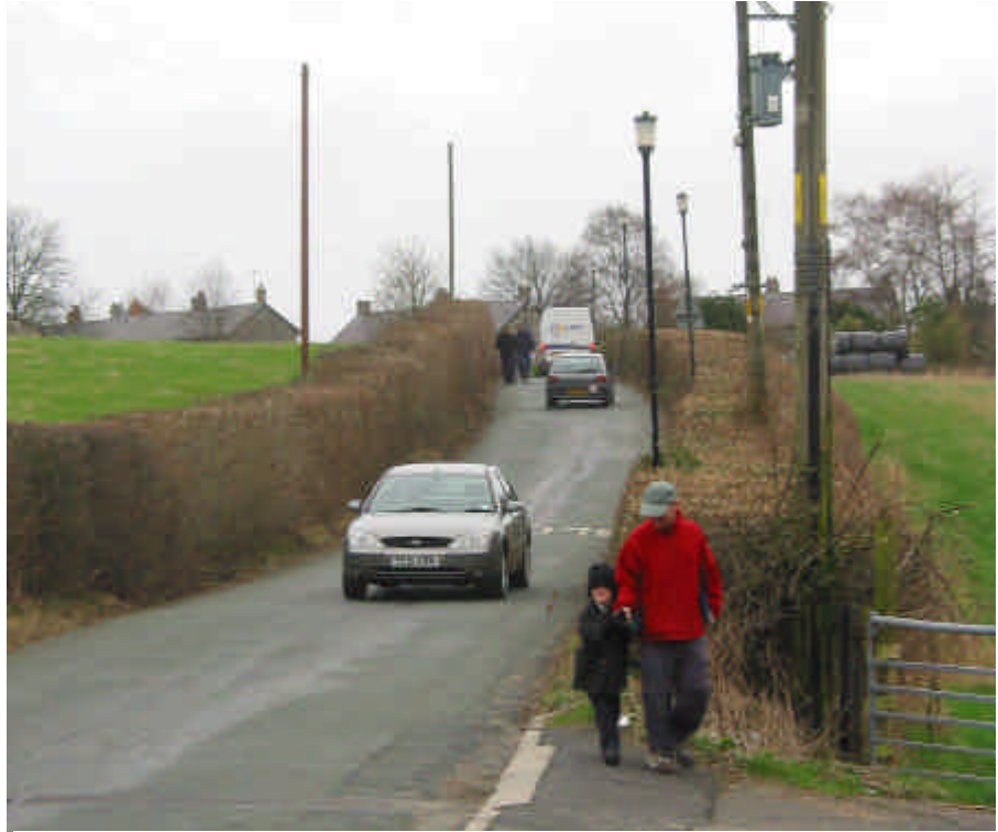
Another safe arrival at school

There is a commitment to trying to establish a footpath linking the two villages. Residents wishing to walk to the Village Hall, the churches, pub or school, find this very