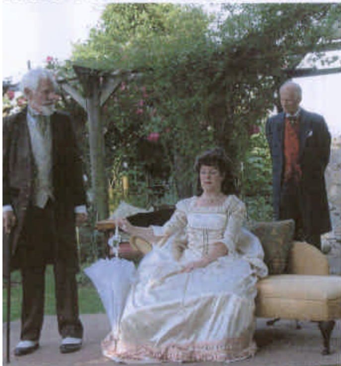
Outdoor theatre for St John's Church