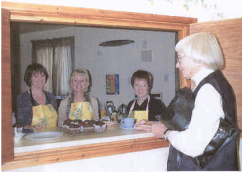
Coffee Stop in The Village Hall