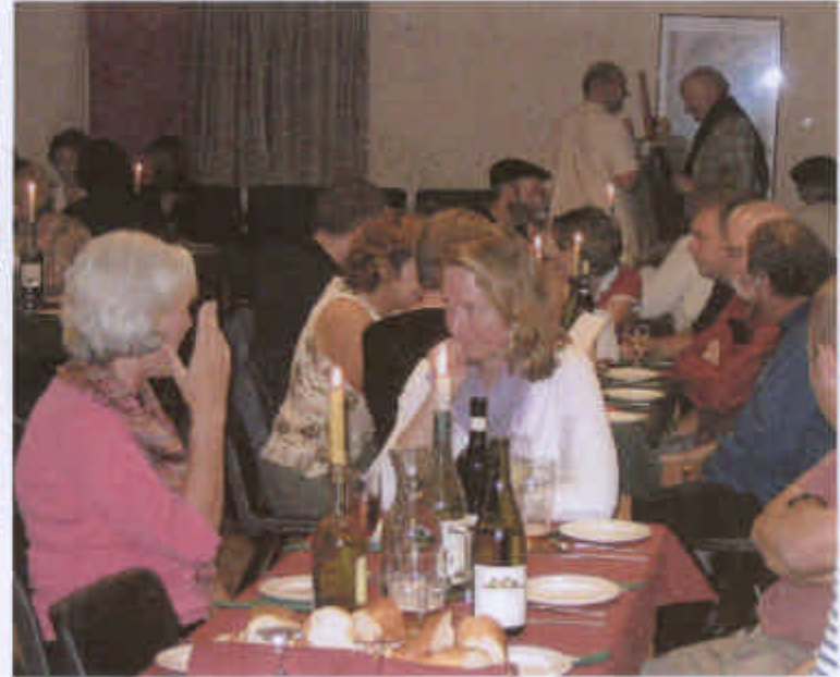
French Evening in The Village Hall